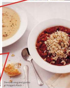
She-crab soup and gumbo at Poogan's Porch