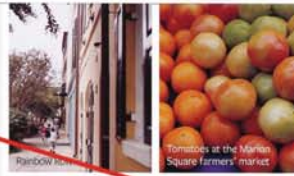
Tomatoes at the Marion Square Farmers' market

72 Queen St., (843) 577-2337 Indulge in Low-Country Cuisine 101: gumbo and she-crab soup. (Poogan was a neighborhood dog who begged for scraps.)